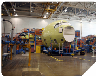
Manufacturing and Assembly